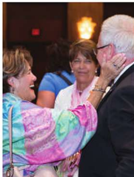
Guests mingle at Arch Klumph Society events during the 2022 Rotary International Convention in Houston.